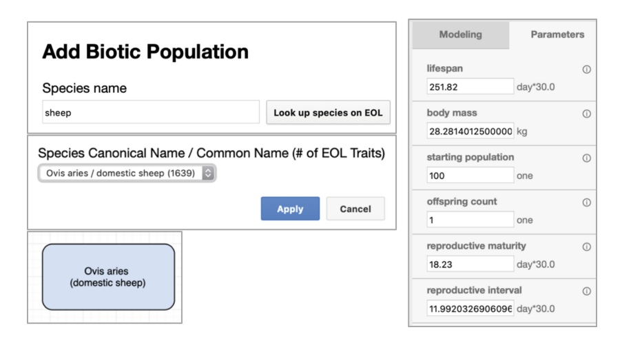
Fig. 1. Automatic filling of simulation parameters retrieved from EOL.

"domestic sheep," and VERA extracts the species attributes from EOL that are relevant to the agent-based simulation (see Fig. 1). This provides the learner with valuable data that a student would be hard-pressed to locate and make sense of, reducing the cognitive load in model creation.